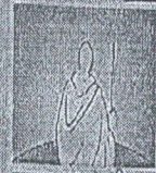
उन्नत भारत अभियान UNNAT BHARAT ABHIYAN

Call to Higher Educational Institutions to be part of UBA