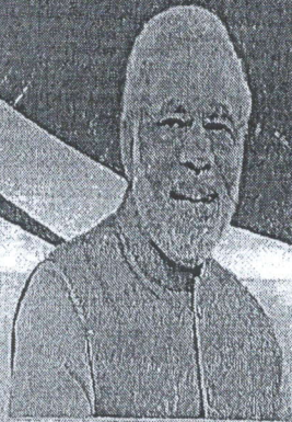
Narendra Modi Prime Minister